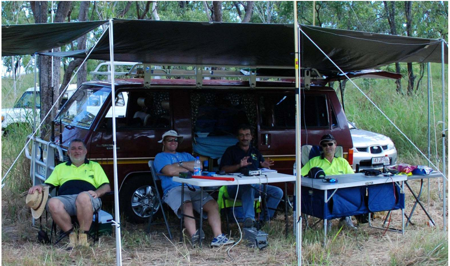
The TARC radio guys at the hillclimb