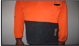
Figure 1-The fire damaged clothing